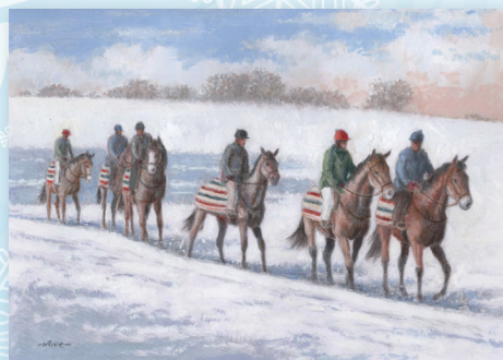
Newmarket Downs in Winter