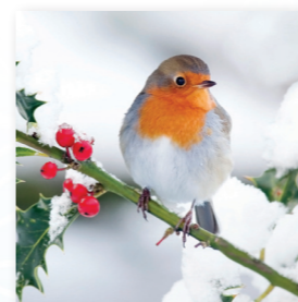
Robin in the Snow