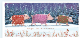
Pigs in Blankets