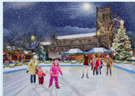
Haverhill in Winter