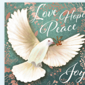
Rose Gold Dove