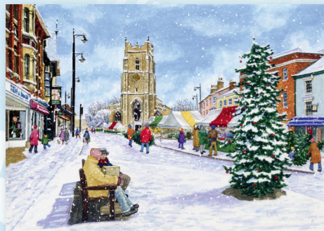
Sudbury in Winter

Greeting 'Best Wishes for Christmas and the New Year'