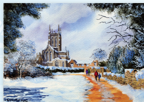
Bury St Edmunds in Winter

All proceeds go to St Nicholas Hospice Care