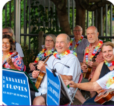
Bury Ukulele Players