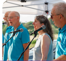
ShantyFolk - Suffolk