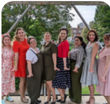
Eddie's Swing Sisters