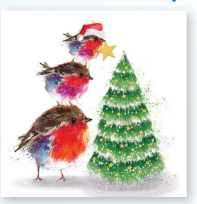
Fluffy Robin family tree