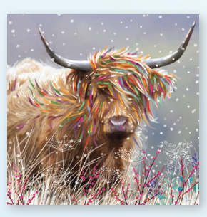
Winter Highland Cow