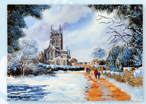
Bury St Edmunds in Winter