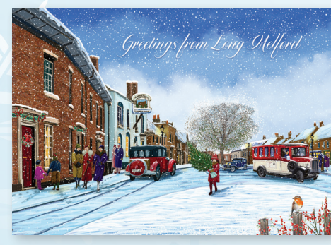
Long Melford in Winter