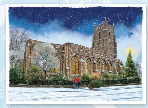
Sudbury in Winter