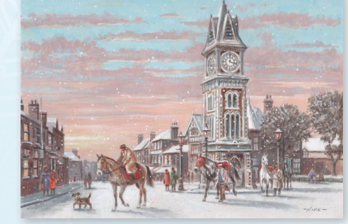
Newmarket in Winter