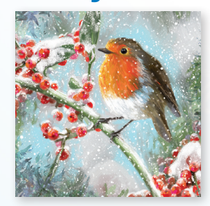
A Robin appears