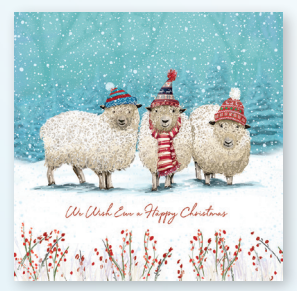
We three Sheep