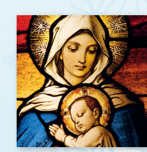
Glory to the new born King Stained glass Mary and child